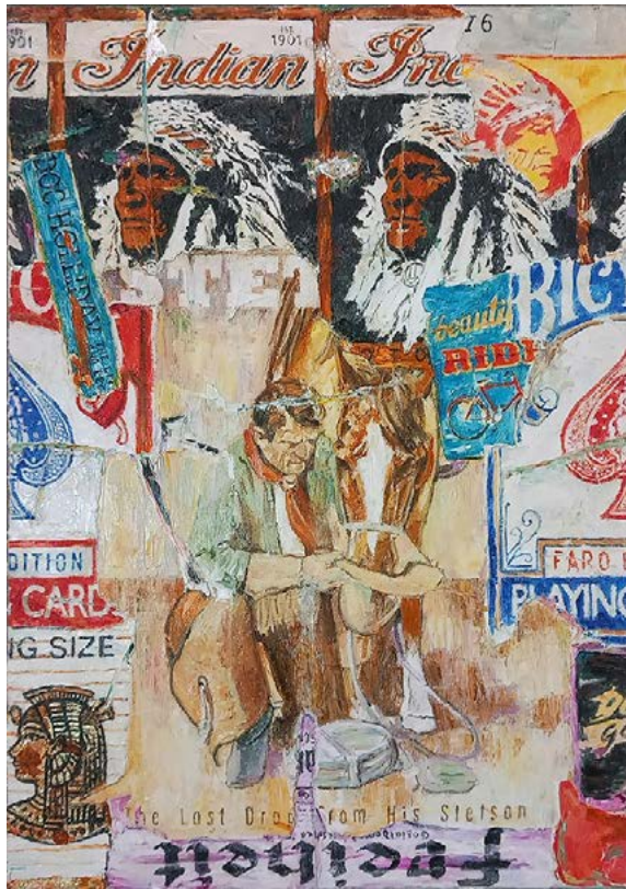
Mauer IV, Element minus 53, The Last Drop From His Stetson