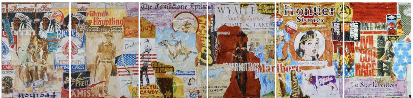
Element minus 53 THE LAST DROP FROM HIS STETSON